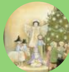
Perfect Christmas Tree

Red and Lulu, a pair of cardinals, make their home in “the branches of a mighty evergreen” outside a suburban house: “It was the perfect place to live, all year long.” But one day, Red returns to find that the tree has been cut down and placed on a truck, with Lulu trapped inside.